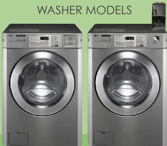
GCWP1069CS2 – Card-Operated Washer