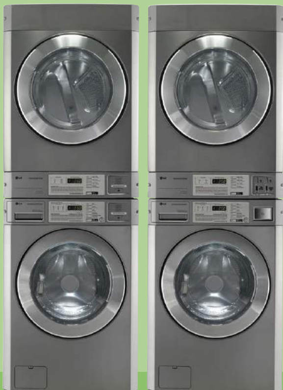
GCWP1069CD2 – Card-Operated Washer, Lower Stack