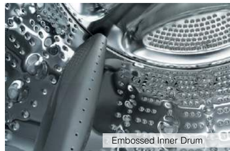
Embossed Inner Drum