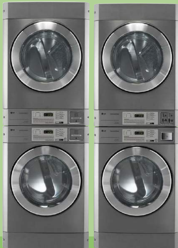
GD1329CGD2 – Card-Operated Dryer (gas), Lower Stack