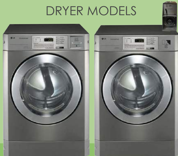
GD1329CGS2 – Card-Operated Dryer (gas)